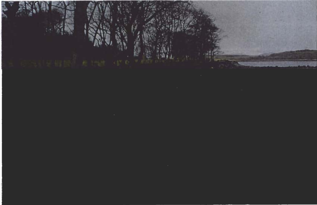
Plate 4. Serious coastal erosion to the west of Garlieston Bay