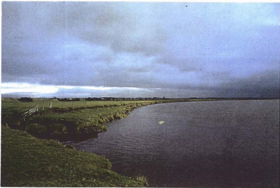
Plate 2. Redkirk Point looking eastwards, note the slope failure on the edge of the field.