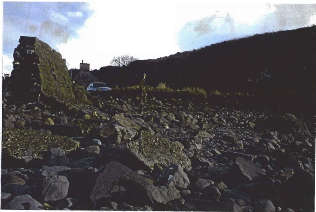
Plate 1. General shot of the ruined Stairhaven pier and eroding section.