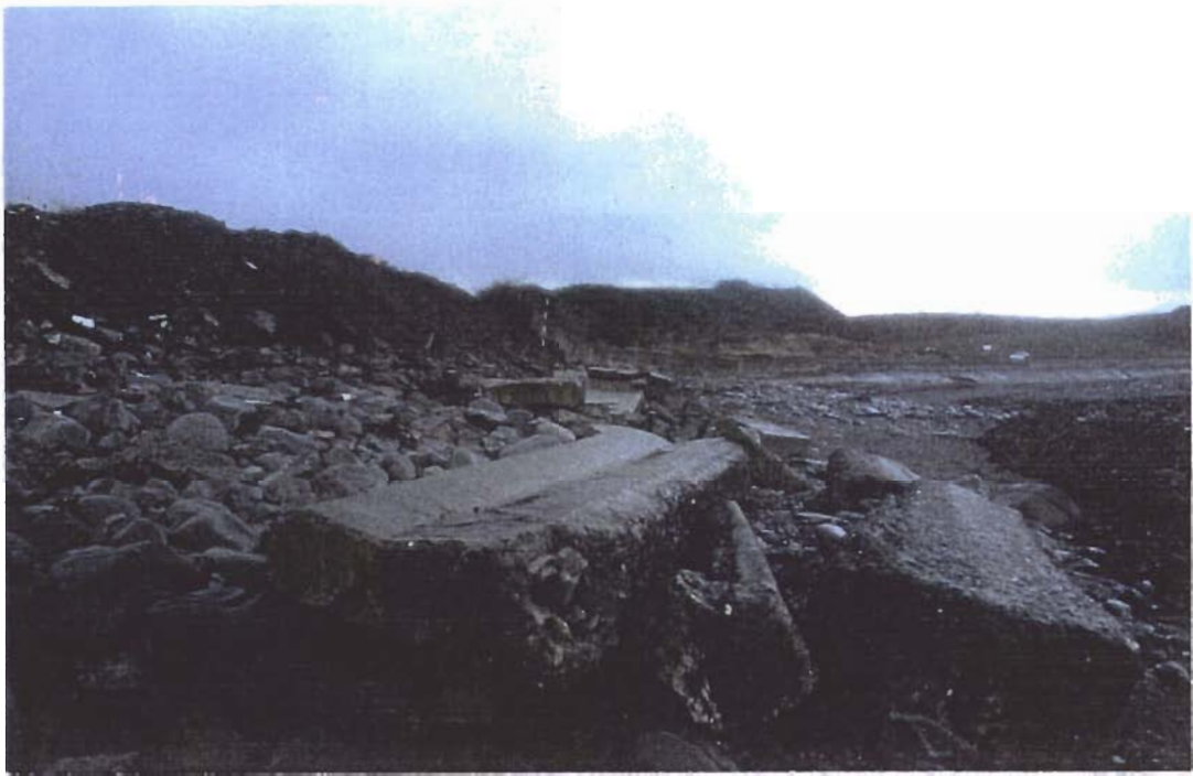
Plate 3. Eroded sea defences at Low Gurghie.